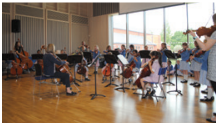
Year 3 String Showcase

This year, we decided to continue with the String Project in Year 3 and we were delighted to be able to welcome parents in to showcase what the pupils had achieved in their lessons. The children were excited to show off their string playing and what a lovely way to end the week, sharing in the joy of performing music together.