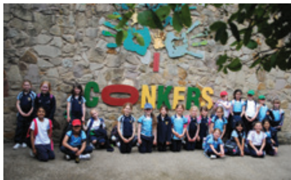
3VS at Conkers!