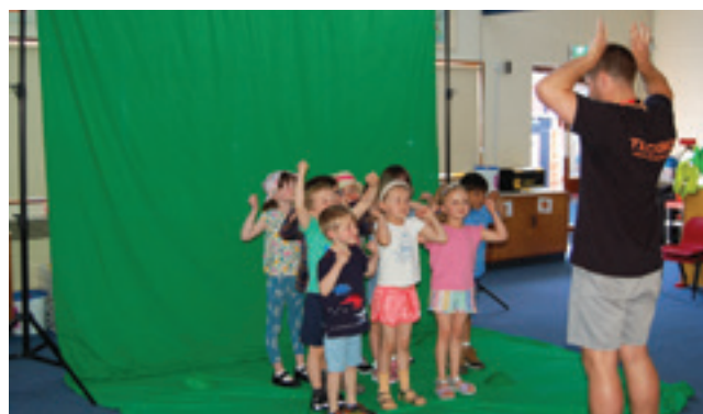
REB making a dinosaur film