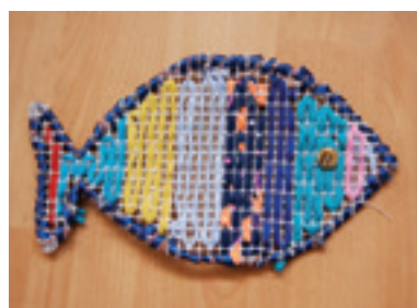
Woven fish by Libby in 3LG