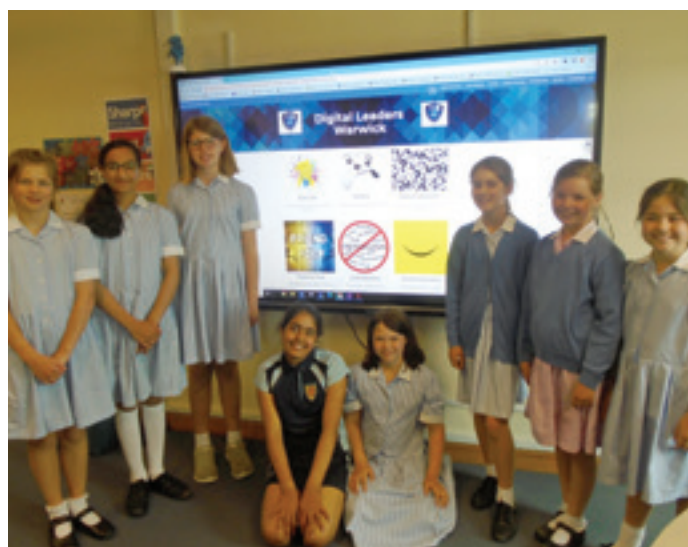
Our Digital Leaders

The teams shared the Warwick Online Safety website through assemblies at both Warwick Junior School and Warwick Prep School and received some fantastic feedback from both fellow pupils and staff.