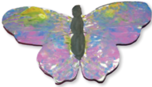
Joe in 1AJ - Tessellating butterfly