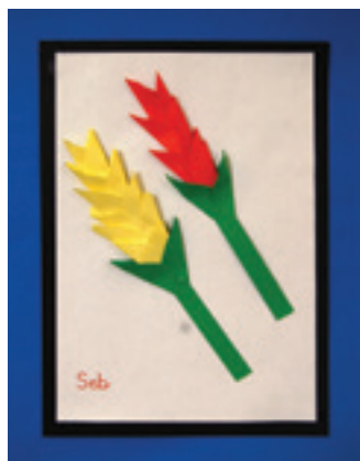
Rainforest heliconia flowers by Seb in 1HC