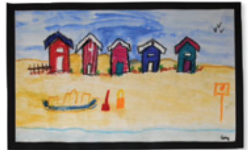
Gaby in 2EC - 'The Seaside'