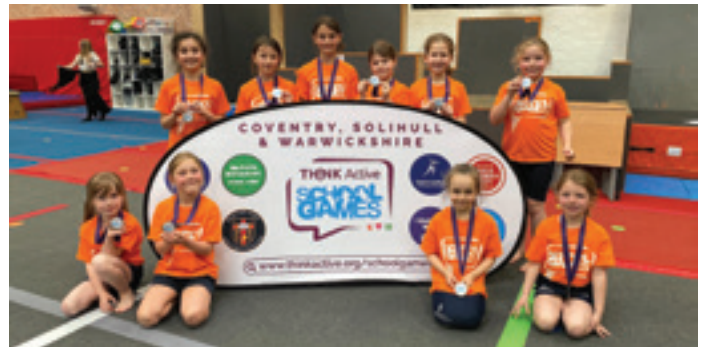
Year 3 gymnasts at the CSW county school games competition

We like to offer a range of opportunities and it has been wonderful to see so many of our children enjoying dancing. We were so proud of all who took their dance exams and passed with flying colours. In addition to this, the pupils have continued to thrive in gymnastics with Year 3 coming out victorious in the CSW county school games competition.