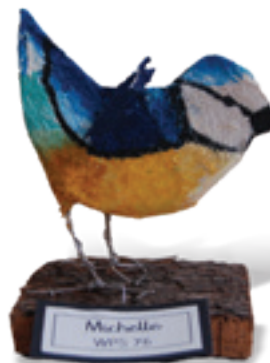
Michelle in 6CM - 3D sculpture