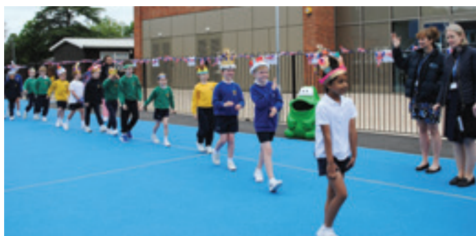
Pre-Prep crown parade

Pre-Prep opened the festivities with a homemade crown parade - a regal riot of paper, glitter and glue. The playground was soon filled with an array of colour, made up of crowns fit for a queen.