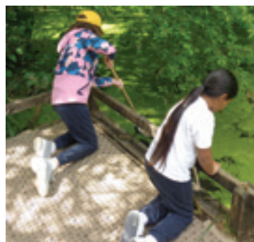
A dip in the pond