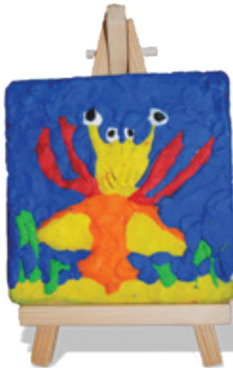
Louis F in 2AD - Sea creature tile