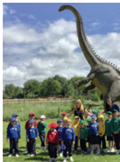
RHS enjoying All Things Wild