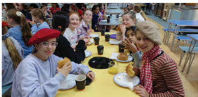
Enjoying a French breakfast