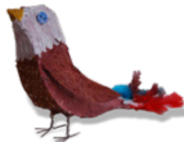
Eva in 6CM - 3D sculpture