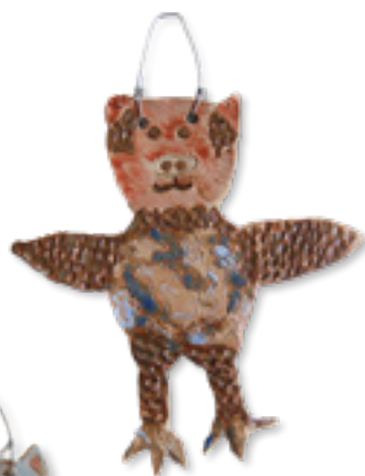
Maggie in 5WS - Surrealism