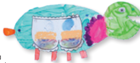
Dinosaurs Love Underpants by Nimi in REK