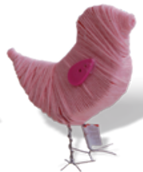
Isabel in 6SW - 3D sculpture