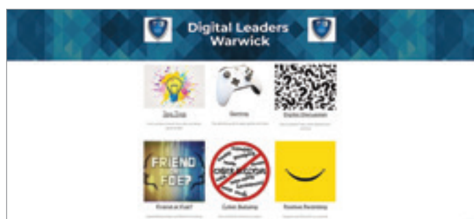
Digital Leaders' Online Safety Website

Within the website, the Digital Leaders teams have researched six different areas of online safety and focused on Top Tips, Friend or Foe, Online Relationships, Gaming, Positive Parenting, Digital Discussion Page and a Puzzles and Games page. Here, they have included links and tips to help fellow pupils and parents navigate the online jungle, to make their digital experiences better. The most exciting part of the site is the Digital Discussion page. Pupils have created some online forms for both children and parents so if there is a digital query, then these can be submitted through the site and answered on the page as part of the Frequently Asked Questions section.