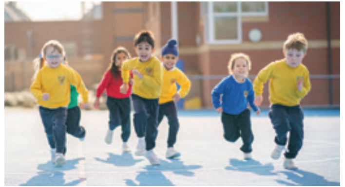
Reception children racing to the finish line in their Games lesson

Football is not the only sport the children have had national success in at an awe-inspiring venue. The U11 swim team travelled to the London Aquatics Centre to compete in the IAPS national finals. The children put in a sterling performance and came away with Silver in the freestyle relay. With over 140 schools there on the day, this truly is an incredible achievement.