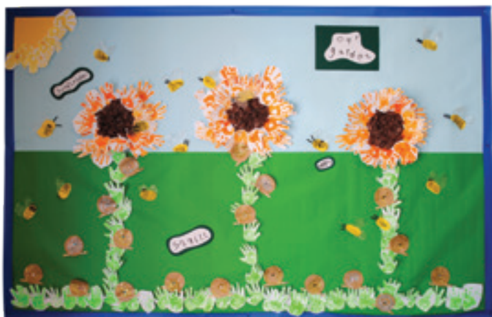
Bee friendly garden by NPB