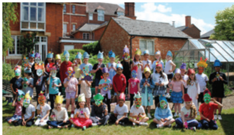
Ancient Mayan Day