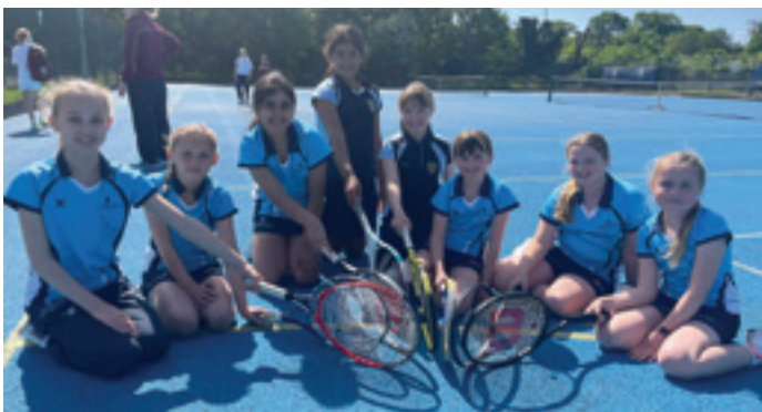
U10 and U11 tennis team

Our footballers have gone from strength to strength this year. Through hard work and passion, our U11 team have been unbeaten in the local league, as well as becoming number 3 in the country after playing in the national finals at St. George's Park.