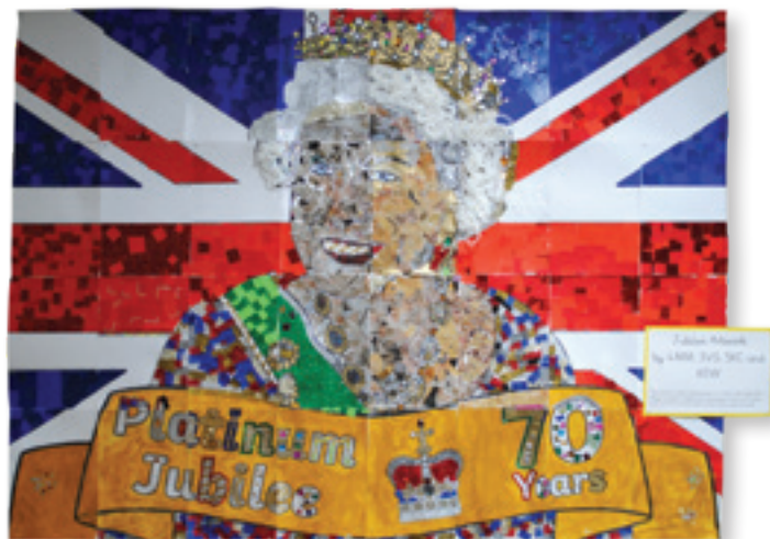
Queen collage created by pupils in 3VS, 4MM, 5K and 6SW