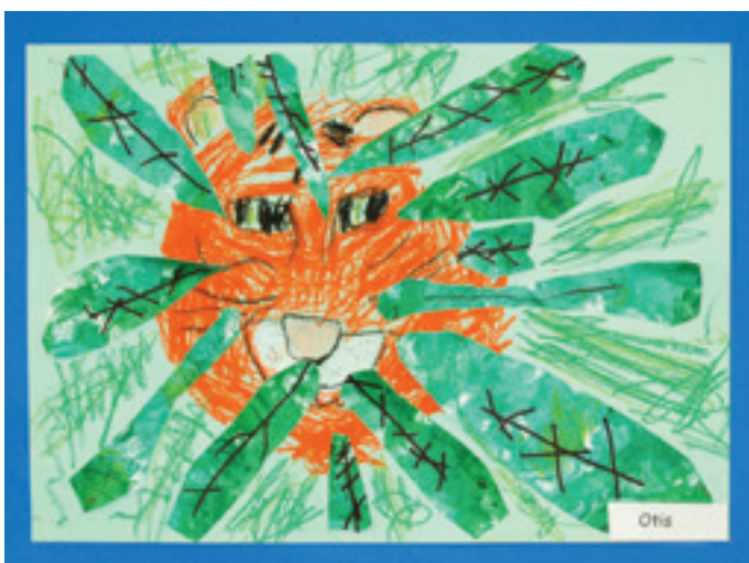
Tiger by Otis in 1JB

We've come to the end of a fabulous summer term and fantastic year in Year 1. We have watched each child grow in independence, resilience, perseverance, and confidence, ready to move on to the new challenges of Year 2. They are more than ready! Happy holidays and best wishes to all!