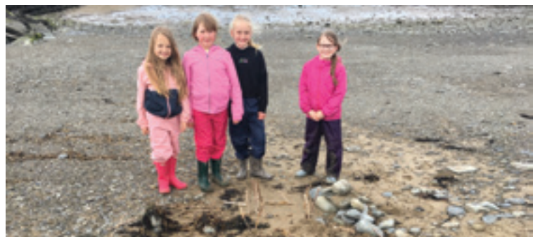
Creating carousel rides for crabs