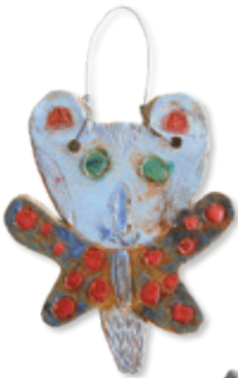
Tilly in 5KC - Surrealism