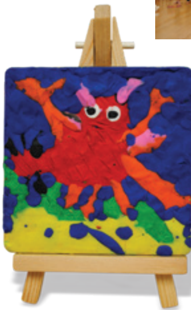
Sea creature tile by Louis M-K in 2AD