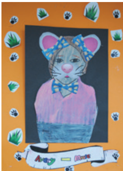
Production poster by Avery in 2JA