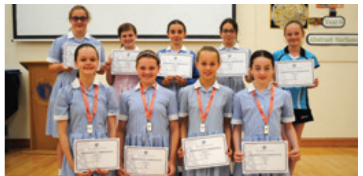
U11 swim team returning from the IAPS national finals

I have no doubt that all the children at Warwick Prep will continue to flourish in sport. Through enjoyment, you develop passion and enthusiasm. We wish all the children a fun summer full of activity.