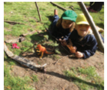
Margot and Elodie in RHS with their dinosaur habitat

Reception children have used the natural resources found to create dinosaur habitats around the Forest School, followed by a dinosaur hunt and becoming palaeontologists to build dinosaur skeletons.