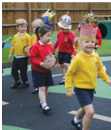
Marching band crown parade in Nursery