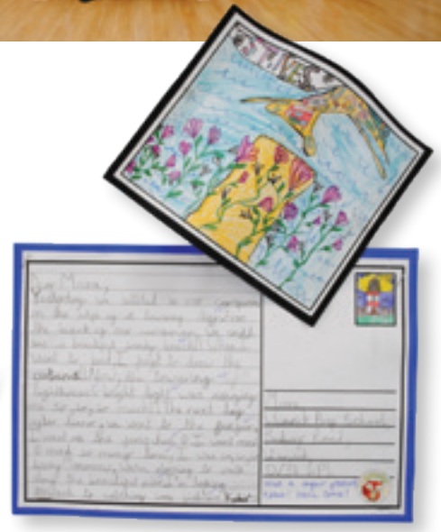
Seaside postcard by Kabir in 2JW