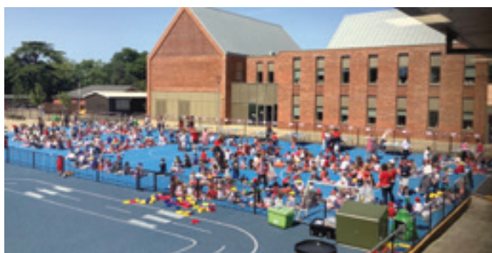
Enjoying afternoon tea in the sunshine