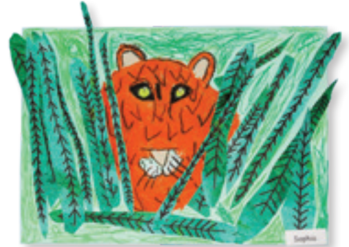
Sophia in 1JB - Rousseau inspired tiger