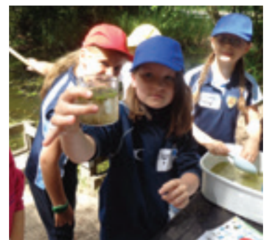
Scarlett in 4MM with her pond creatures