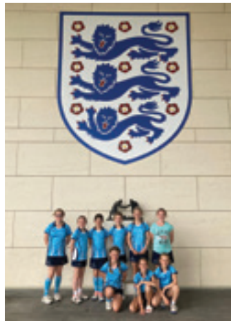
U11 football team at St. George's Park

Another activity we have made big strides in this term is tennis, with over 50 children attending each recreational club and our squad pupils gaining success at fixtures and our very own tournament. It's great to see so many children enthusiastic about participating.