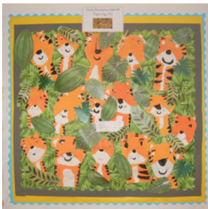
Henry Rousseau inspired tigers by 1AJ