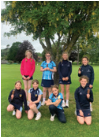
At the IAPS cricket final

Cricket is still relatively new for us, but the pupils have made some monumental steps. We have had full year group fixtures across the age groups, as well as traveling to Millfield Prep School for our first IAPS competition in the sport. Most notably was the joint fixture with Warwick Junior School – a big step forward for the Foundation, with 12 Warwick Prep pupils participating in hard ball fixtures. I have no doubt that there is an exciting journey ahead of us with this sport.