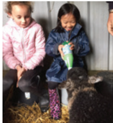
Fun feeding the lambs at Naturesbase residential