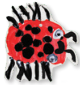
Ladybird by Charlie in REB