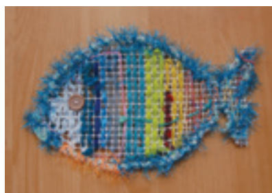
Woven fish by Tuppence in 3VS