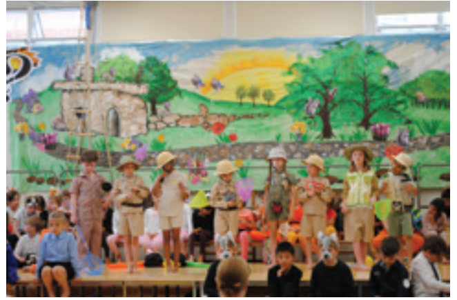
Production of What's The Crime, Mr Wolf