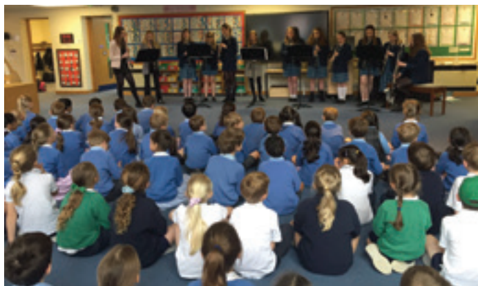
King's High School Clarinet Ensemble