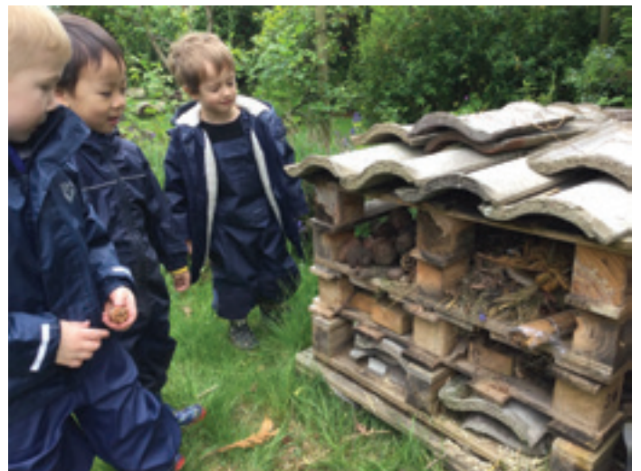
Henry, Theo and Rory in NAL checking in at the bug hotel

We were very excited during our pond dipping sessions at the variety of water creatures we found; newts, pond skaters, water boatmen, fish, snails, and even a frog was spotted.