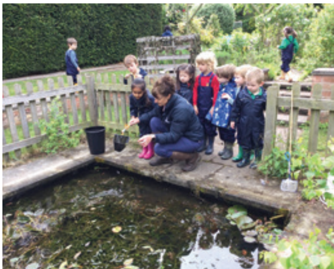
NHT investigating pond life

Part of the Forest School ethos is taking care of our environment so the Nursery children embraced this while learning about minibeasts. They collected natural materials, pine cones, bark, leaves and pebbles to add to our bug hotel.