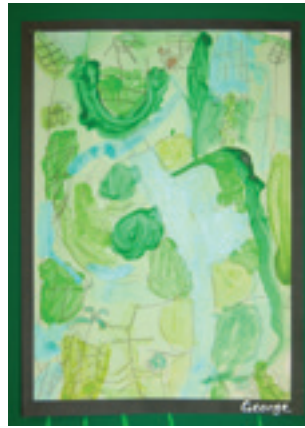
George in 1JF - Rousseau inspired rainforest