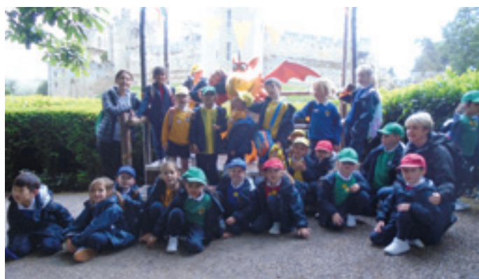
Visit to Warwick Castle