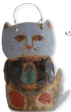
Connie in 5LW - Surrealism