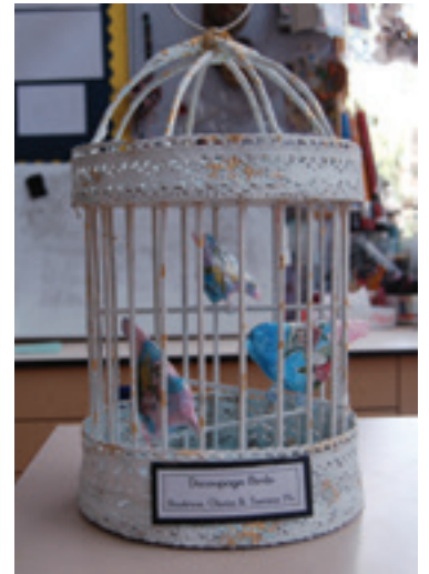
Botanical Garden bird sculptures by Beatrice in 4JB, Olivia in 4MM and Sienna in 4AM