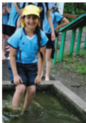
Bani in 3LG braving the barefoot walk