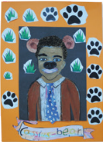
Cassius in 2JA - What's The Crime, Mr Wolf poster