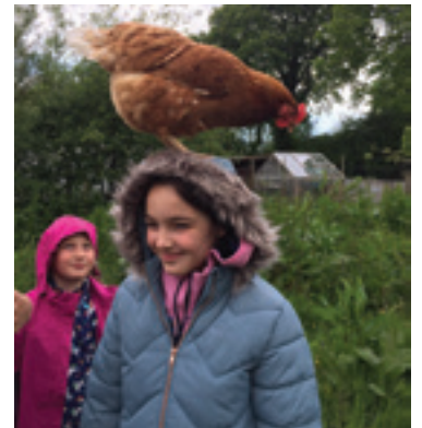
Taking chicken care to new heights!