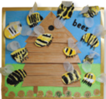
Buzzy beehive by NHT