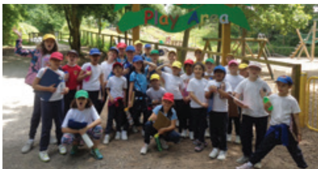
Visit to Ryton Pools