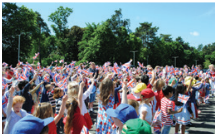
Getting ready for the raising of the flag

What a wonderful celebration, that all the children will remember for many years – perhaps 70 and more!