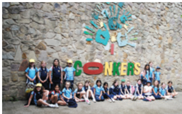
3LG at Conkers!